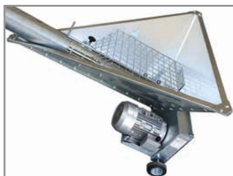
Inlet hopper with flow control and rollers

On request, you can get more variations individually adapted to your needs.