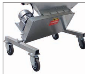
Option: swivel castors under inlet hopper