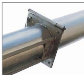
Option: folding joint incl. intermediate bearing