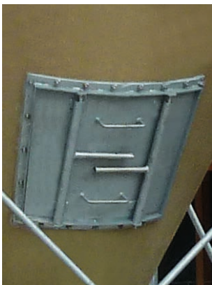
Separate access hatch