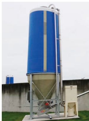
Special colour for silo