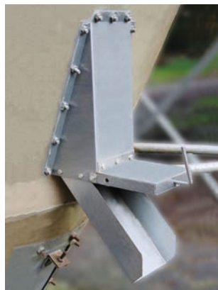
Manuel slide for silo hopper