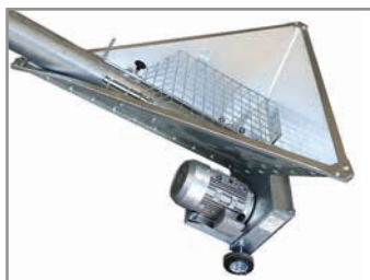
Inlet hopper with flow control and rollers

On request, you can get more variations individually adapted to your needs.